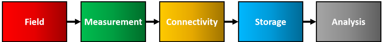
Figure 1 Flow chart of digital data collection

Figure 1 illustrates a flowchart detailing the process of digital data collection. In this setup, the operational machinery (or complex plant) is equipped with a selection of appropriate sensors and data acquisition systems to conduct real-time measurements. Subsequently, the collected data can be stored and analyzed for various purposes, whether on local platforms or remotely through a network.